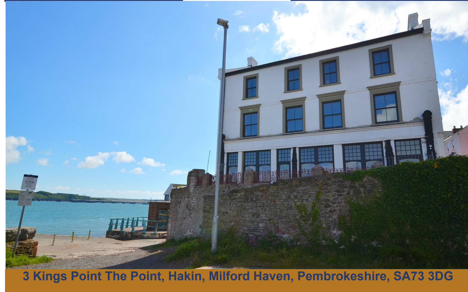
3 Kings Point The Point, Hakin, Milford Haven, Pembrokeshire, SA73 3DG